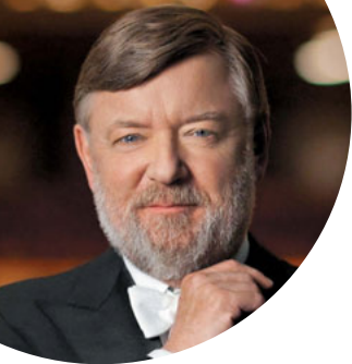
Sir Andrew Davis