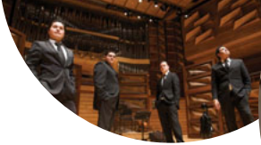
Simón Bolívar String Quartet