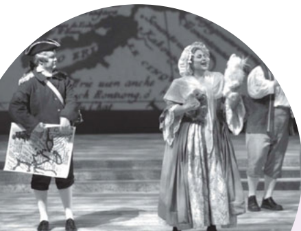
Taptool! , 2003 Opera Division production

7:30 pm | Walter Hall | Pay what you can